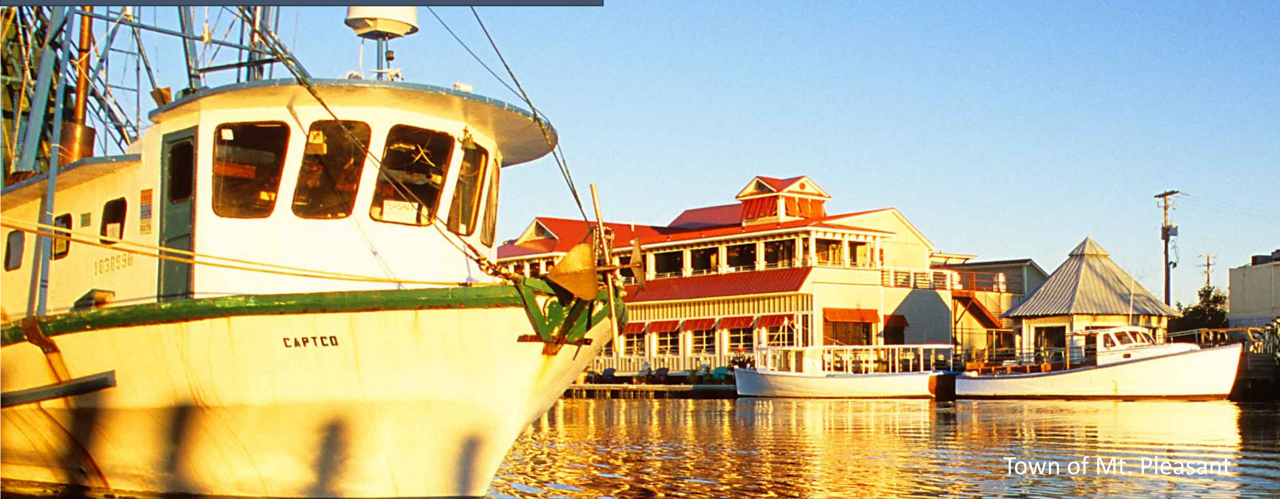
Town of Mt. Pleasant