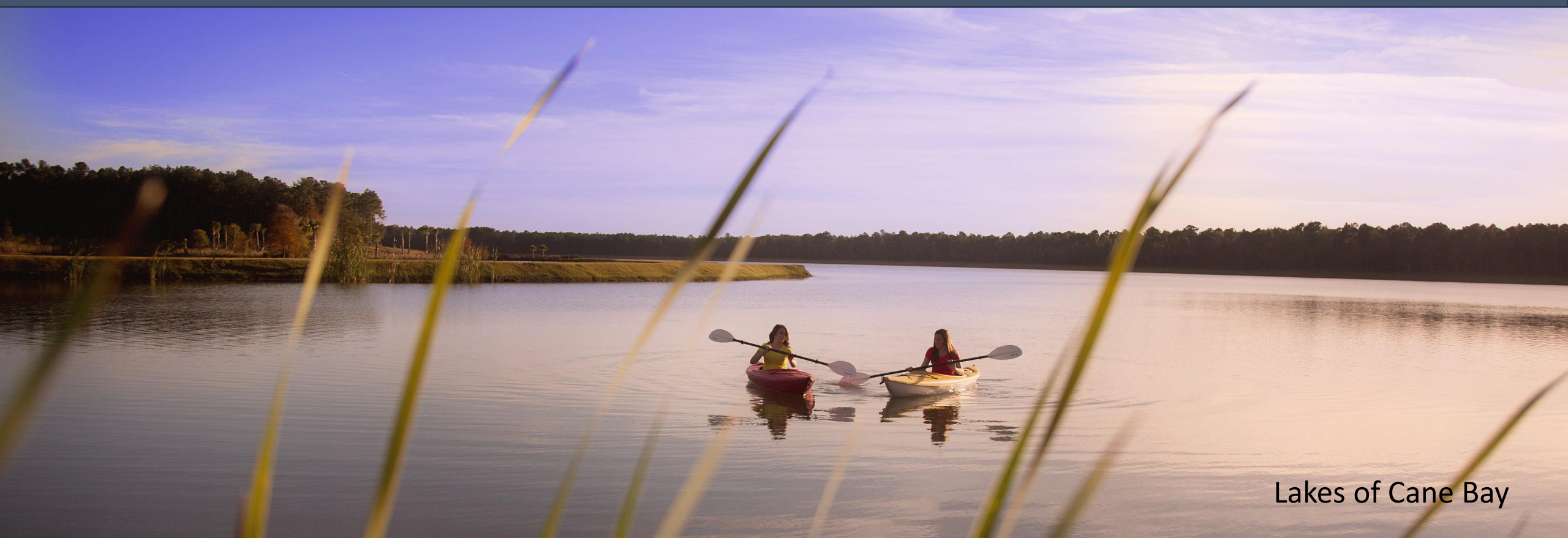
Lakes of Cane Bay